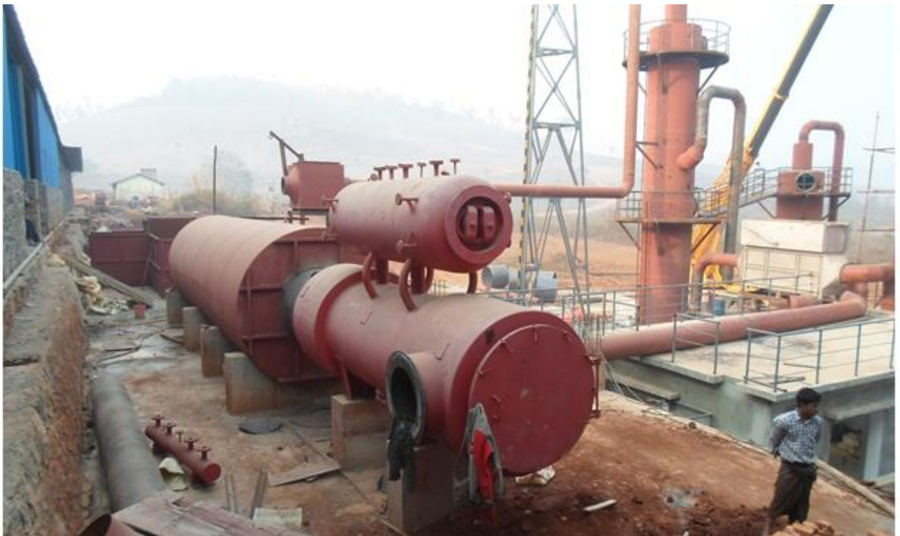
Figure 2: Lashio Zinc refinery