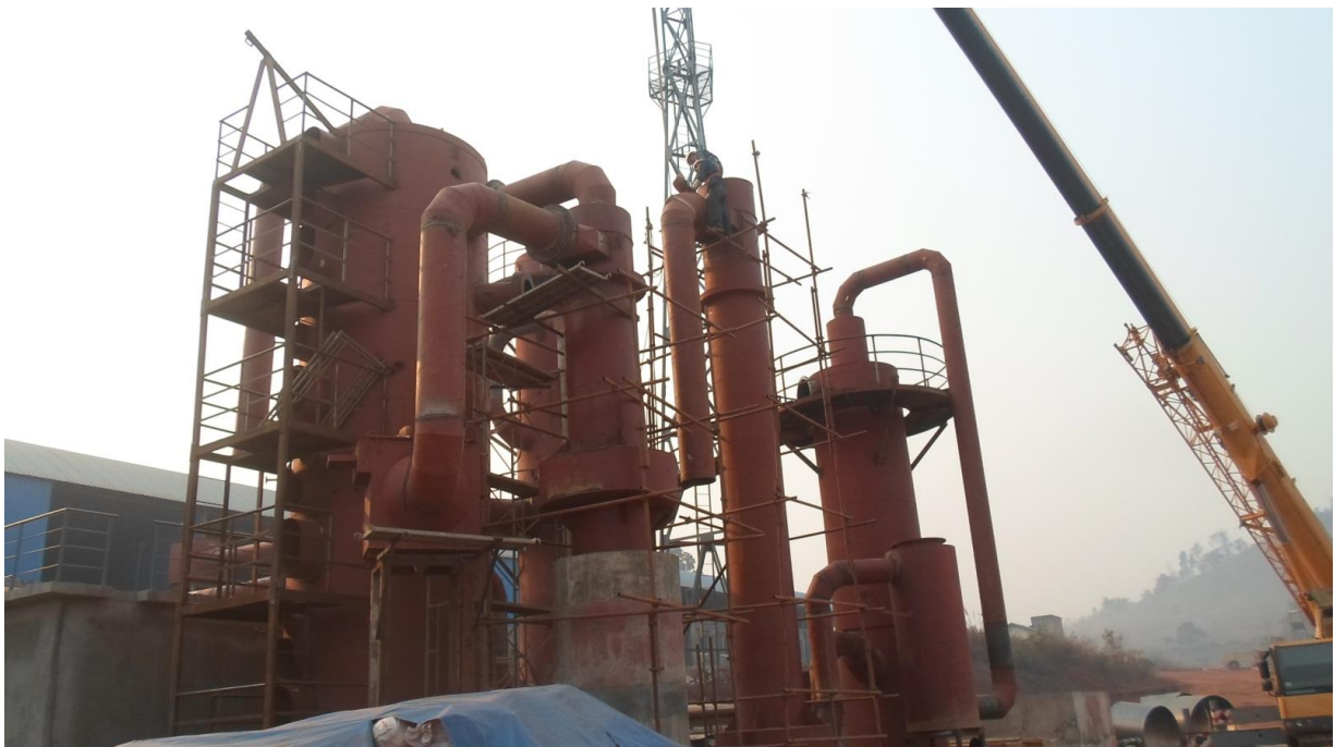
Figure 4: Lashio Zinc refinery