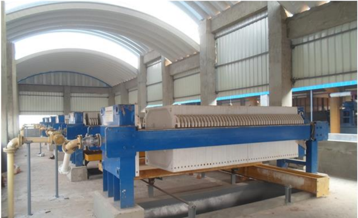
Figure 3: Lashio Zinc refinery